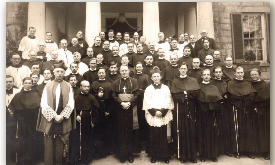
Archbishop Curley and Friars at Carrollton Hall, 1928